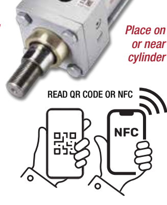
PLACE OUR (EST) ELECTRONIC SERVICE TAG ON YOUR CYLINDER

QR Code - comes standard on any smart phone by scanning with its camera. NFC Technology - comes standard on most smart phones — simply touch the tag with your phone.